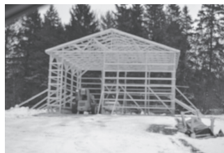
Bottom Photo: Pole Barn at Broadacres site