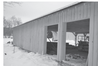
New pavilion at Wilderness Park